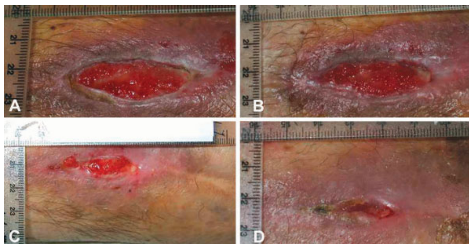
Figure 3. Evolution of a typical skin ulcer treated with PRGF: debrided ulcer before treatment (A), after 1 (B), 4 (C), and 8 (D) weeks, respectively. [Color figure can be viewed in the online issue, which is available at www.interscience.wiley.com .]

0.05). Figure 3 shows a representative case of an ulcer treated with PRGF. At the end of the study, complete healing was observed in only one ulcer from a patient in the PRGF group.